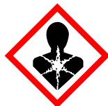
GHS08 Health hazard