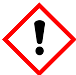
GHS07 Exclamation mark